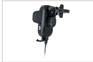
Mounting on air vent