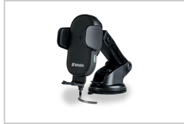
Mounting on dashboard

Download high-res images from the marketing directory: www.verbatim-marcom.com