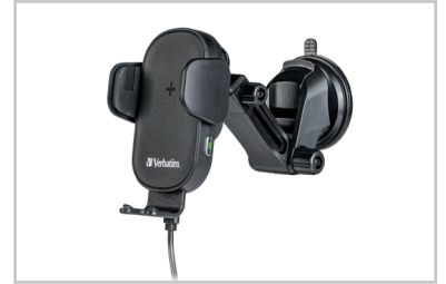
Mounting on windscreen